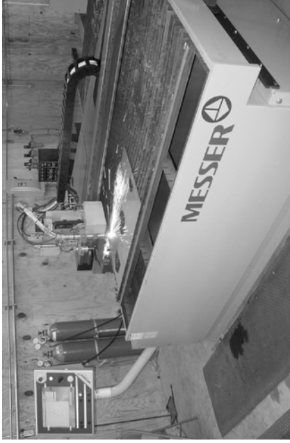
CNC Plasma Cutting Machine