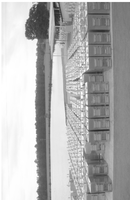
Stock Heaters at Hardy

Hardy Manufacturing is one of the largest buyer of 304 stainless steel in the southeast, with sales exceeding 3,000 furnaces a year and over 40,000 furnaces previously sold. Hardy is the 1 st manufacturer of outside wood burning furnaces in the world with over 30 years of experience.