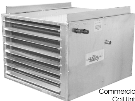
Commercial Fan Coil Unit

With the recent addition of a CNC precision plasma cutting machine, CNC press brake, shear and rollers for its new fabrication shop; Hardy Manufacturing continues to invest in future growth and quality. The computer controlled programming of these machines allows for major improvements in the quality of parts due to machine repeatability and accuracy.