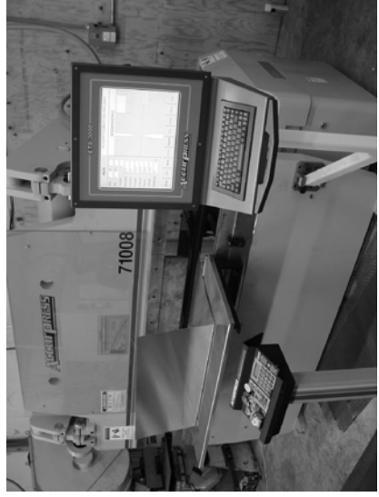
CNC Press Break Machine