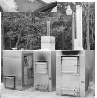
Test Lab Facilities